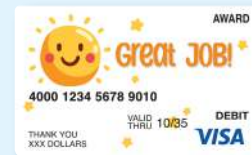
GREAT JOB SUN