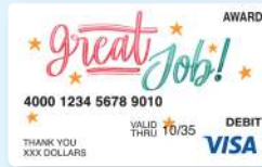
GREAT JOB CALLIGRAPHY