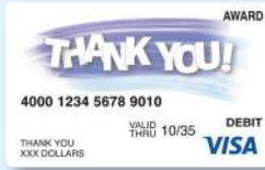
WHITE THANK YOU