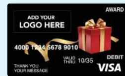
ADD YOUR LOGO