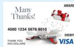
OPEN GIFT MANY THANKS