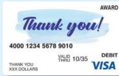
BLUE THANK YOU