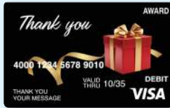
RED GIFT THANK YOU