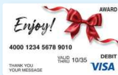
ENJOY RED BOW